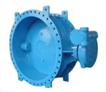
Metal Seated Butterfly Valve